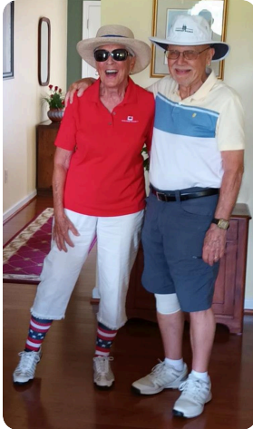
From the UK family visit May 2024