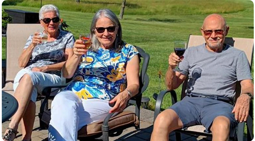
From the UK family visit May 2024